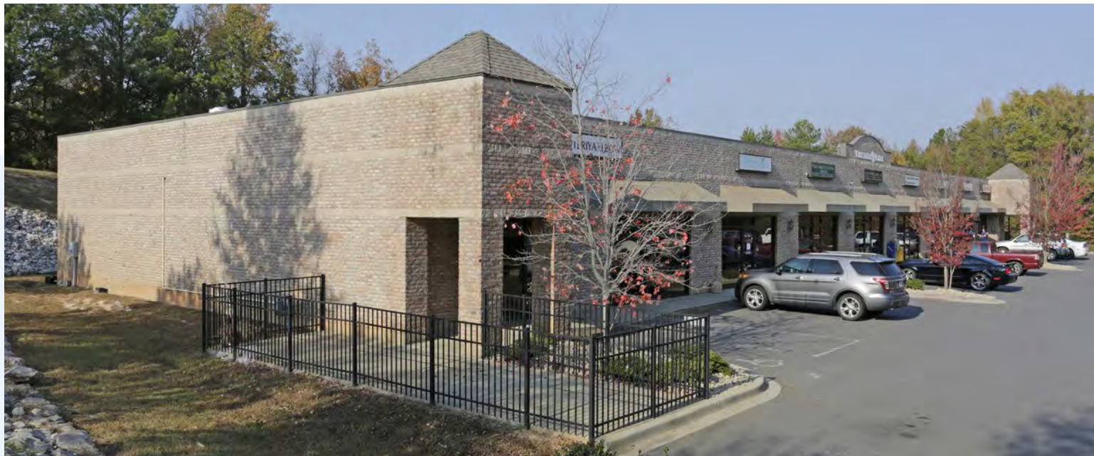
Front of Yorkville Plaza Shopping Center. Available space (1724) on left end.