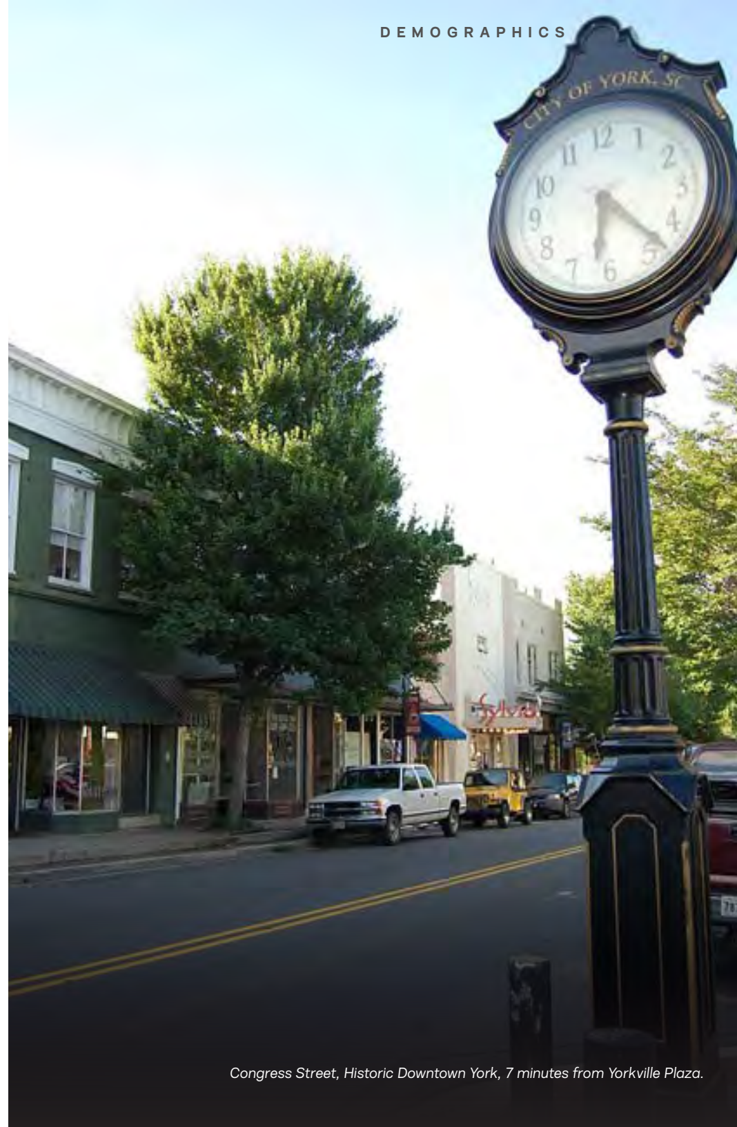
Congress Street, Historic Downtown York, 7 minutes from Yorkville Plaza.